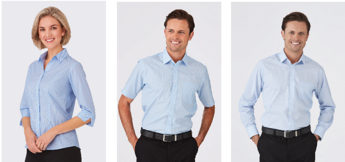
L-R SHADOW STRIPE 2144, 4104SS, 4104LS