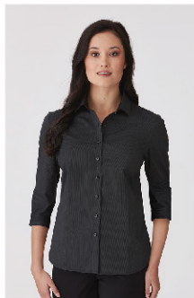
L-R XPRESSO 2257, 2258