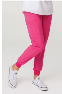
L-R CITY ACTIVE PANT CA4P, SO EZY PANT CA3P, JOGGER CA7P